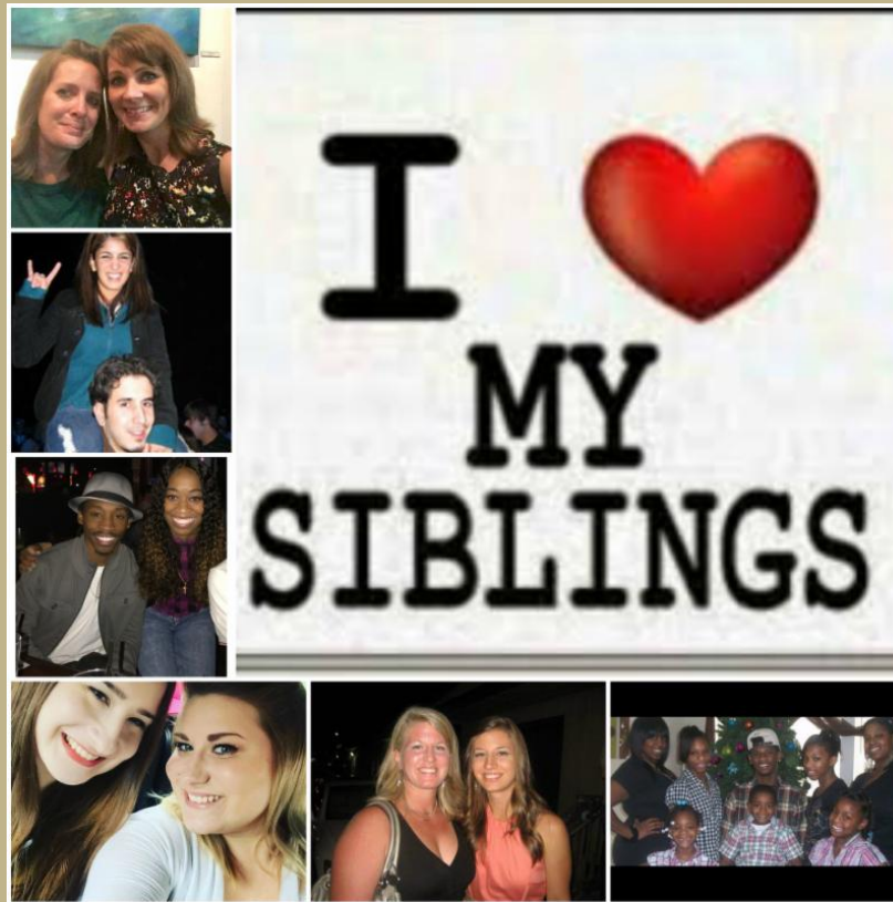
The KLF Staff with their siblings!

Did you know April 10 was National Siblings Day? Family is so important. They laugh with you and cry with you. They love you and support you through the good times and the bad. With them, our life is a little bit more complete.