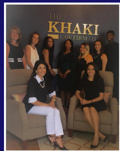
"Guiding you through the Disability Maze!"