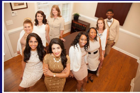
The Khaki Law Firm Team